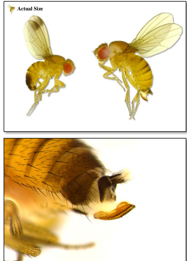
Fig 1. Spotted wing Drosophila (SWD), male (top left), female (top right), and the females serrated ovipositor (bottom). Actual size of the fly is shown in the top left corner.

In Michigan's southern peninsula, first SWD fly activity is typically in mid-June to early July and the population builds through the summer as temperatures continue to rise. Highest densities of SWD occur in August and September, so SWD is especially problematic for later-season berry crops, including blackberries, fall raspberries, ever-bearing strawberries, and late-season blueberries. Adults live for two to three weeks and females can lay more than 300 eggs, so they have the capacity for many generations per