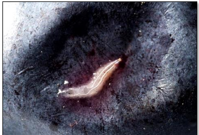
Fig. 3 A large late-instar SWD larva on the surface of a blueberry.