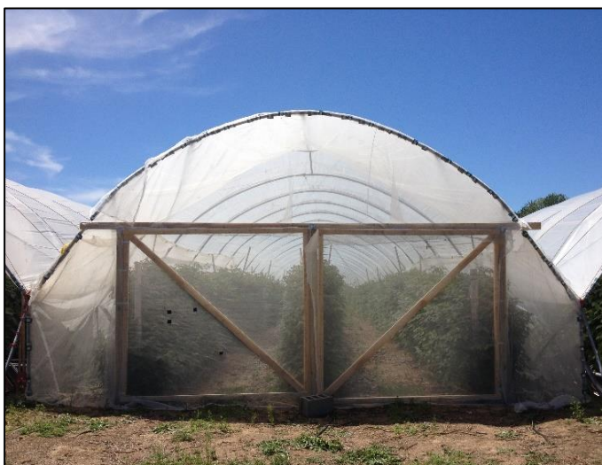
Fig. 6 Exclusion netting fitted to a high tunnel raspberry system, with doors to allow for sprayer access.

Holes from equipment, storms, etc. will need to be patched – taping both sides or using thick