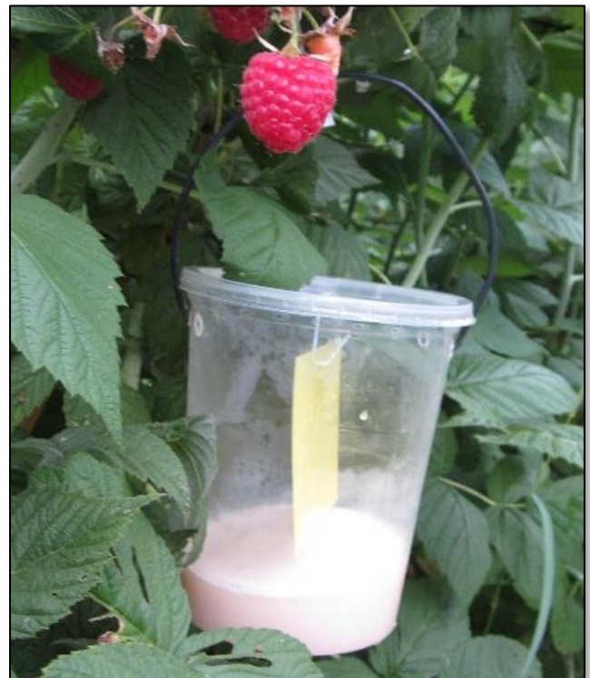
Fig. 2 A yeast-sugar baited monitoring trap with a yellow sticky trap hung within a raspberry canopy.

Traps must be baited to attract SWD. An effective homemade bait can be made by combining 1 tablespoon active dry yeast, 4 tablespoons sugar, and 1.5 cups of water. The bait should be added to the trap with a 1" depth. Alternatively, you can use a commercially available lure. The Scentry lure (Scentry Biologicals, Inc.) is a gel sachet that has catch rates comparable to the yeast-sugar