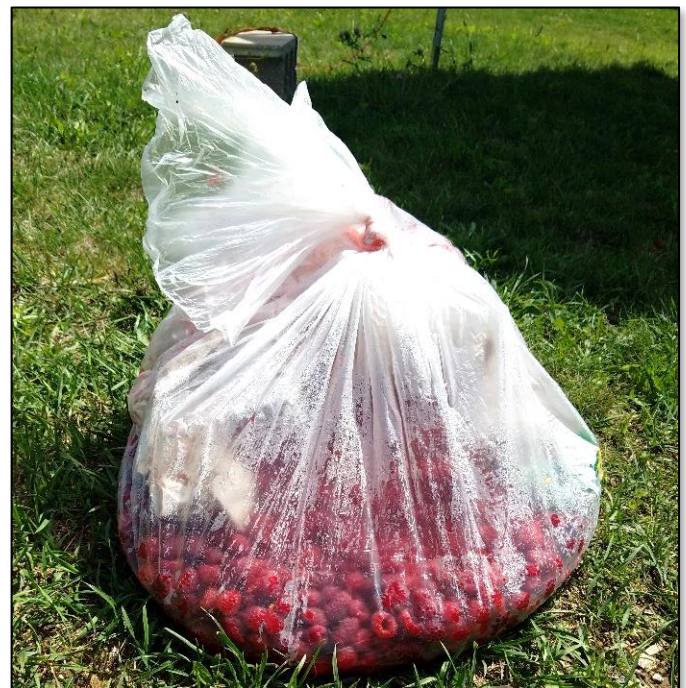
Fig. 4 Waste fruit disposed of in a clear trash bag.

Over-ripe and damaged fruit can act as a reservoir for SWD and other pests, increasing their populations and making them even harder to control. Some U-pick operations have customers collect damaged fruit as they pick,